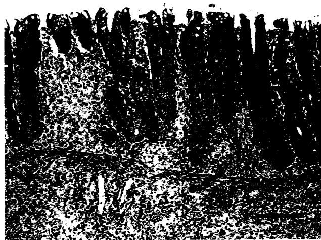
Figure 2. Section of cecum from a mandrill. Note histiocytic infiltrate within the lamina propria and submucosa, with associated crypt loss. Hematoxylin and eosin stain. Bar = 100 \mu m.

In summary, the prolonged disease course was attributed to infection with M. a. paratuberculosis , and death was due to the combined effects of this infection and myocardial amyloidosis, exacerbated by the stress of surgery and anesthesia. Infection with M. a. paratuberculosis likely occurred at a young age in this individual, similar to the development of Johne's disease in ruminants, 1–3 although the source of